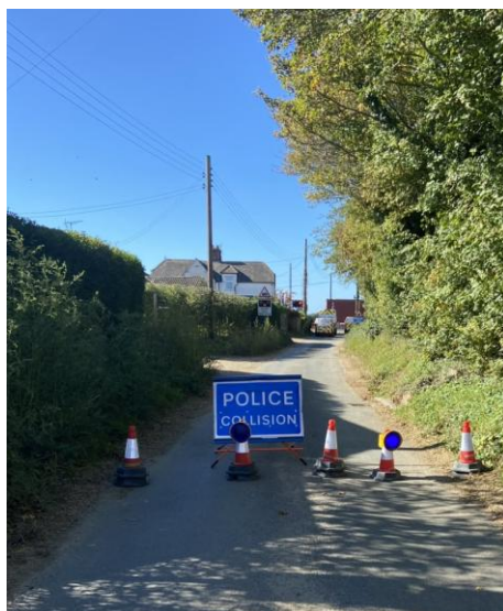
Looking towards an inoperative railway barrier, 6 th October 2025

Railway difficulties disrupted the quiet life of the Thorpe Lane and lower Grimston Lane residents when the rail crossing barriers stuck in October 2025. There is no other legal vehicular access point to those residential areas. Householders could either walk across the fields to the Morston Lane Crossing or head east to the Green Bridge between Grimston Hall and Gun Lane. Although the sign stated there was a 'Collision', this was not the case, but apparently there isn't an appropriate sign for "Barrier Failure". It took two days to repair the crossing. The reason given for this was the despatch of an incorrect part, adding to the delay.