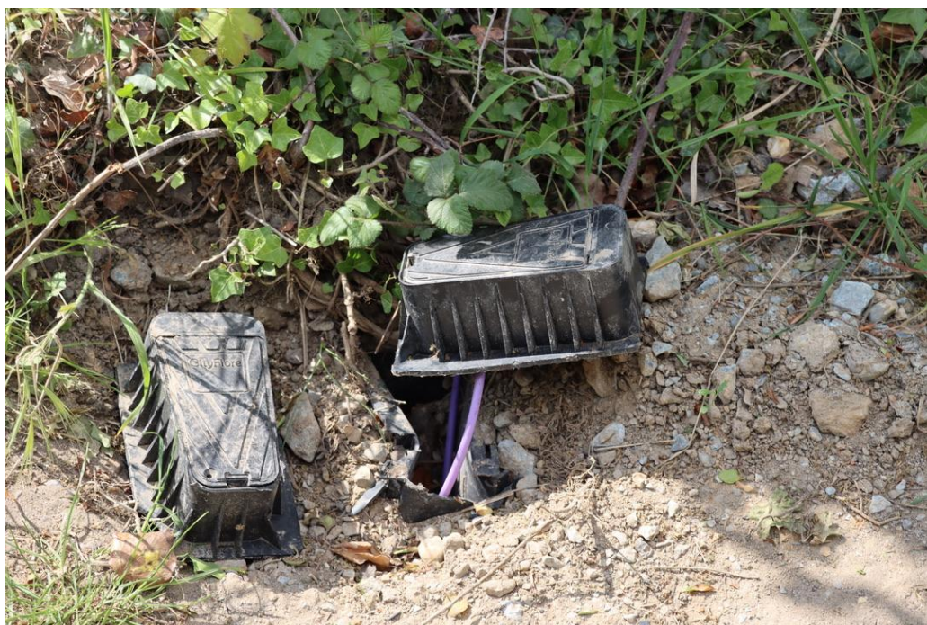
The overall excellence of City Fibre work may be judged by the image above: a cable installation in Thorpe Lane which lay exposed to the elements for at least a month.