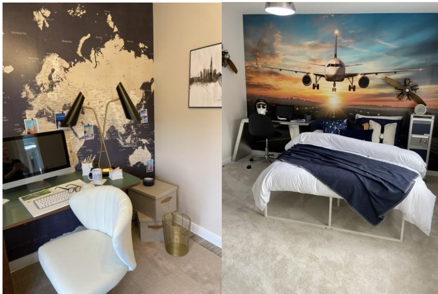
L. "The office of a working mother, who was travel guide." R. "Bedroom of a teenage boy who wants to be a Pilot."