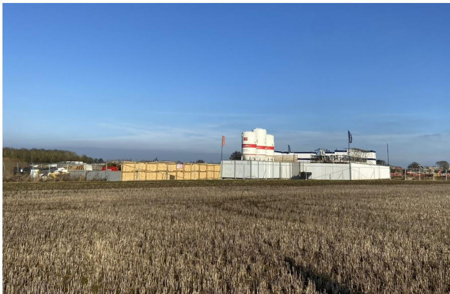
The view from the Gun Lane footpath looking towards Poppy Fields and Grimston Lane ...

In addition to utility upgrades, several new builds required road closure to ensure houses would have comprehensive access to utilities, notably Kingsfleet Park. This development of a hundred and thirty nine new homes, forty six of which are to be affordable homes quickly sprung into life. Simultaneously, the development extended much closer to the green pedestrian Bridge between Gun Lane and Grimston Hall. Ultimately, this area will house the proposed new Trimley St Martin school and new pre-school facilities. The whole development is the first in Trimley St Martin to install electric car charging points to the new homes as a standard fitting. Solar panels are predominant.