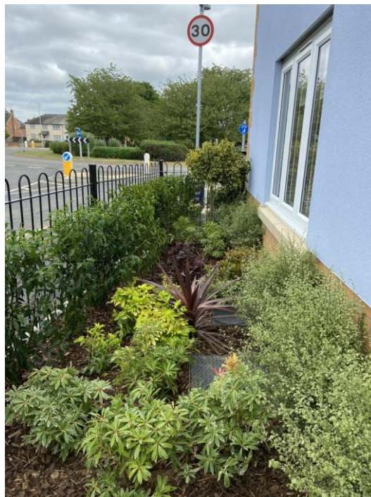
View looking towards the High Road from outside the first Bellway Show Home on Roundhouse Avenue.

The first computer generated images of Kingsfleet Park were published 25 th January 2025 and by the 2 nd of February 2025, the Sales Centre was open. It wasn't until June 2025 I managed to visit the Show Homes and look around them.