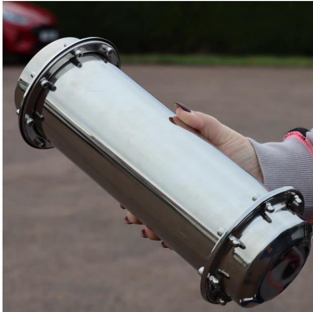
The time capsule waiting to be buried 14 th October 2025

Question: When will the Capsule next see daylight?