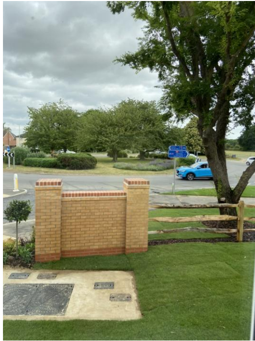
View from the same property looking towards Howlett Way Roundabout from the interior.