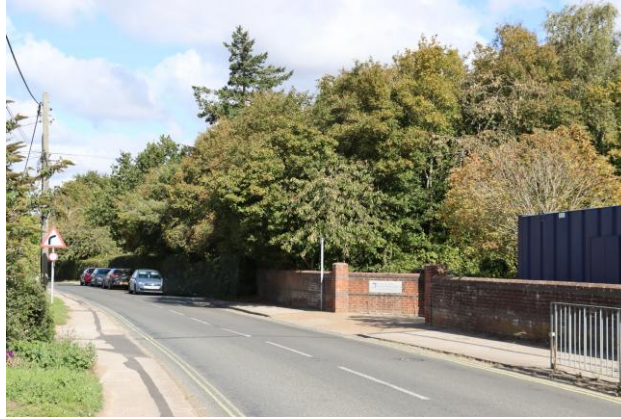
The road outside Trimley St Martin Primary school where the accident occurred. Autumn 2025