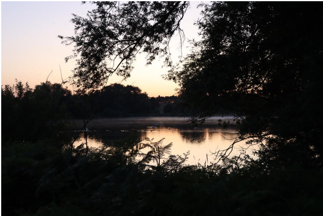
Trimley Shore. 3.23 a.m. 21 st June 2025.

The two hundred year anomaly of 2024's longest day being on the 22 nd of June, returned to normal in 2025. Trimley Shore remains a beautiful place to be. Especially as the sun begins to lighten the skies.