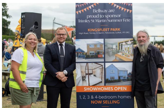
The Opening of the Village Fete.

Bellway also generously sponsored the first Village Fete, which was much appreciated by the organising bodies, Trimley St Martin Parish Council. There had not been a Village Fête for at least fifty five years, when they were organised by the Church, although of course, the Primary School had held Fêtes. Due to the success of the event, the Parish Council agreed to hold another one in 2026.