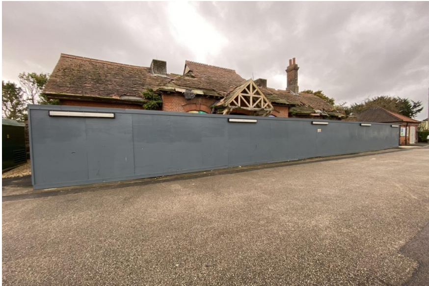
Trimley Station Building 3 rd November 2025