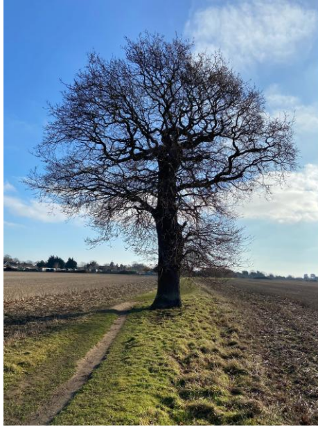
...and the view from the same position, but turned 180° and looking toward Trimley St Mary's Allotments

The first computer generated images of Kingsfleet Park were published 25 th January 2025 and by the 2 nd of February 2025, the Sales Centre was open. It wasn't until June 2025 I managed to visit the Show Homes and look around them.